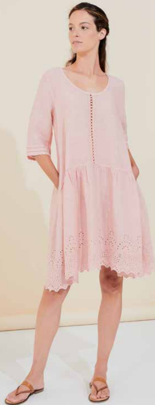
9722 SG dress