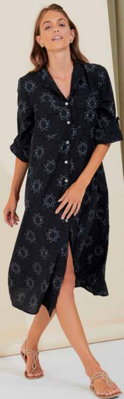
9750 - 81 W dress