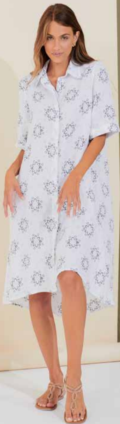
9751 - 81 B dress