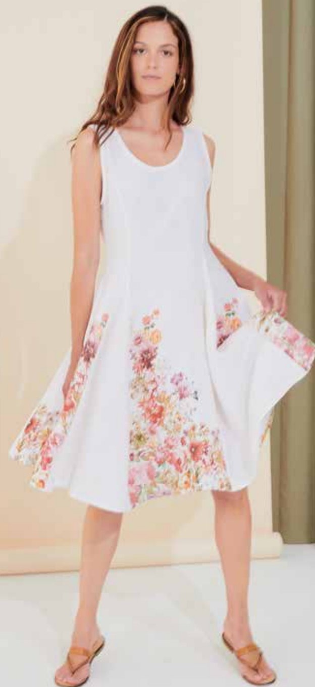
51042 SB dress