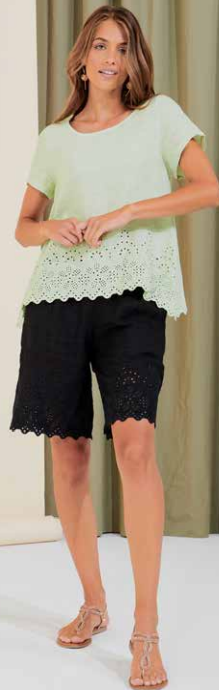
9758 SG top