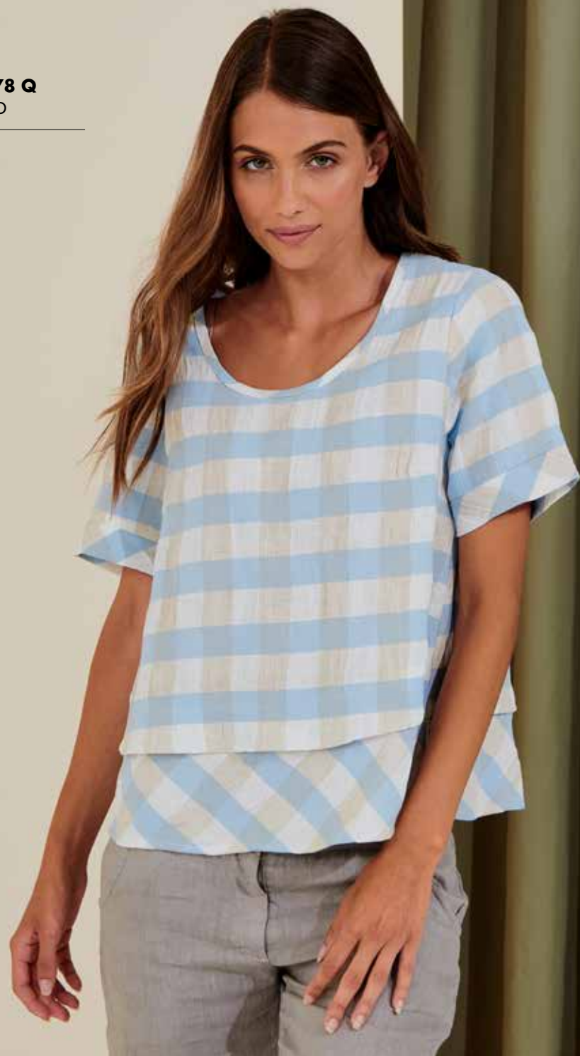
9778 Q top