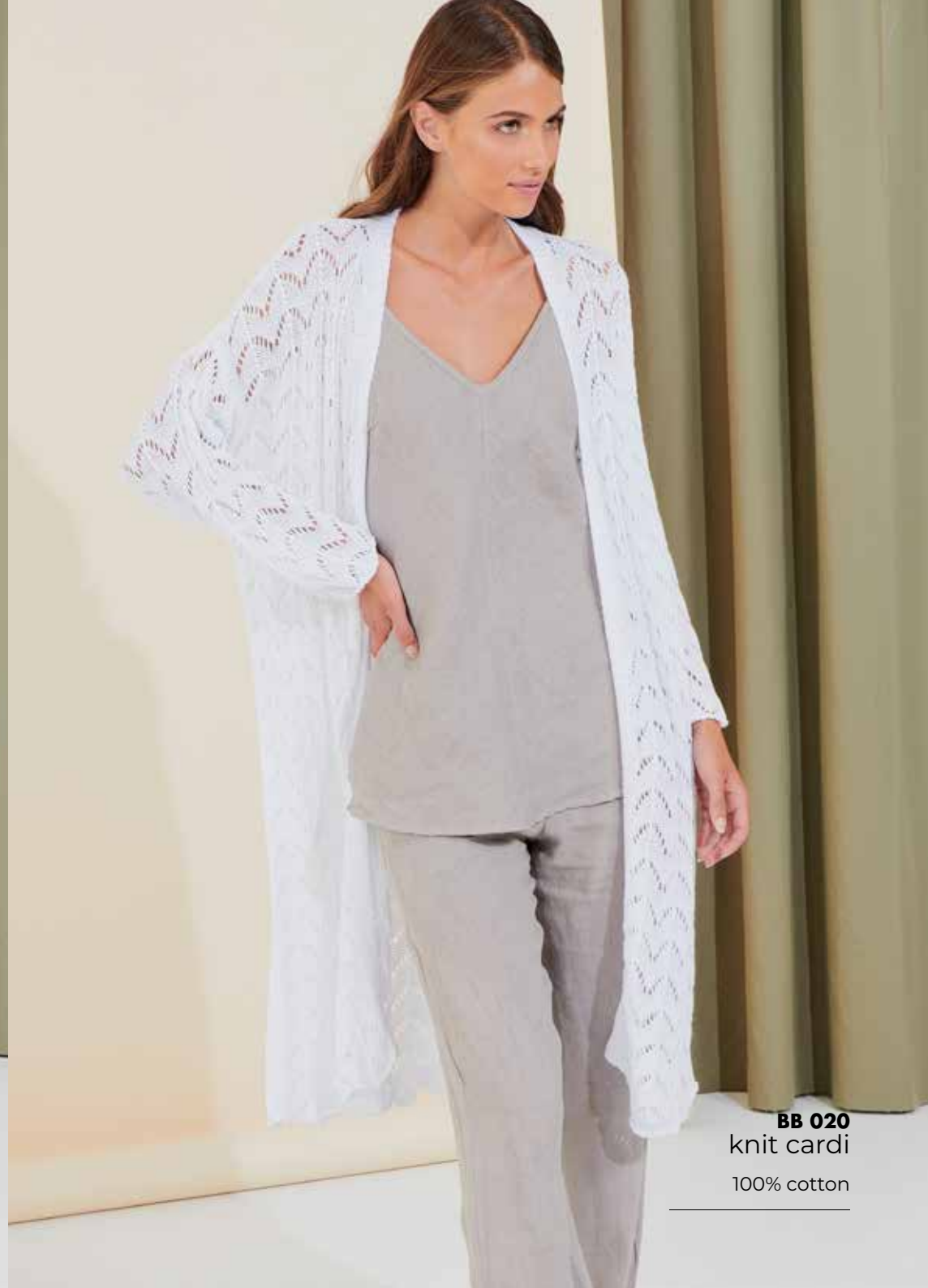
BB 020 knit cardi 100% cotton