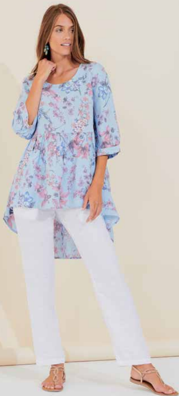
9015 - 36 top