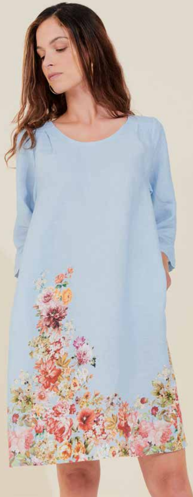
9784 SB dress