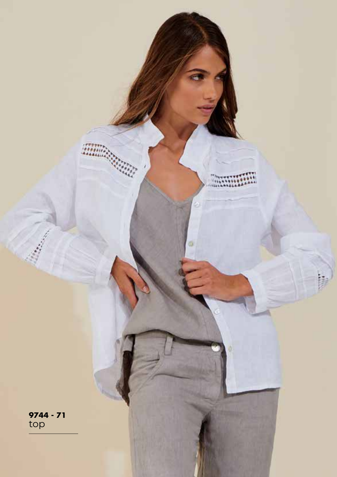
9744 - 71 top