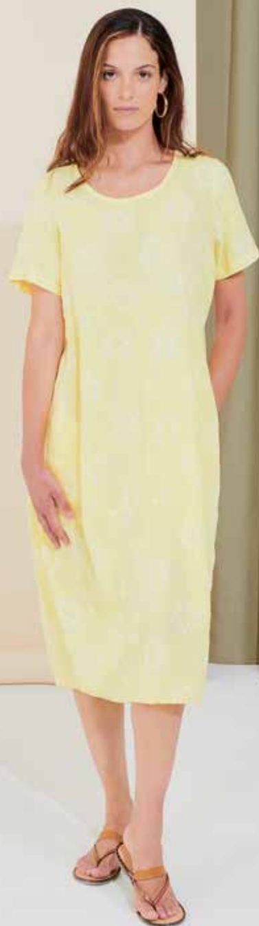
9771 - 81 W dress