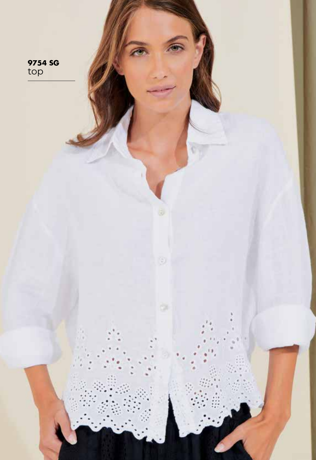
9754 SG top