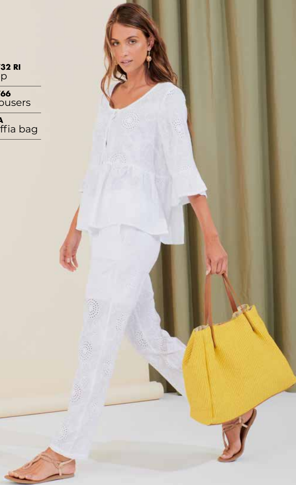
ISA raffia bag