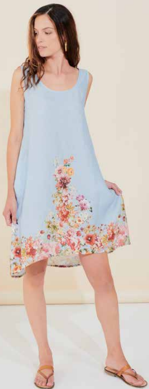
I 9513 SB dress