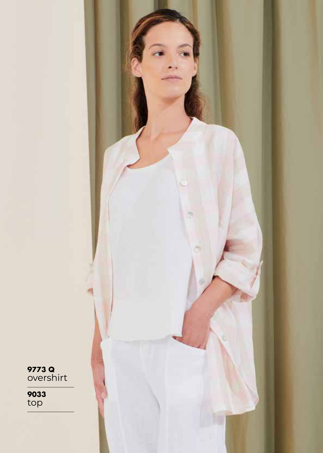
9773 Q overshirt