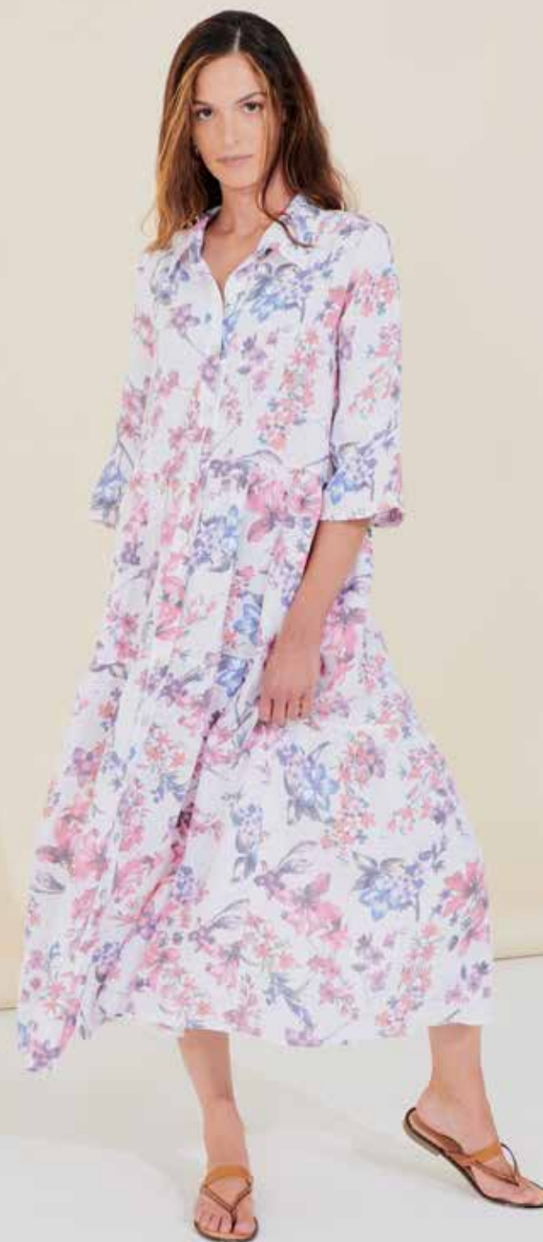
9761 - 36 dress