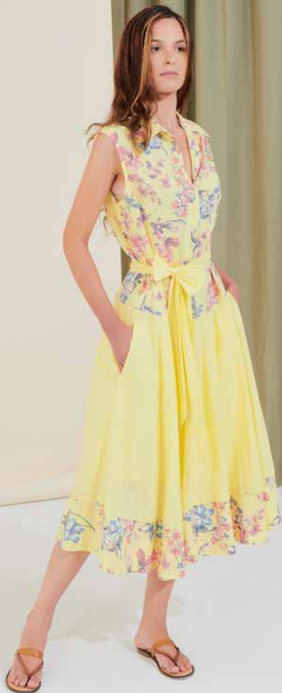
9709 - 36 dress