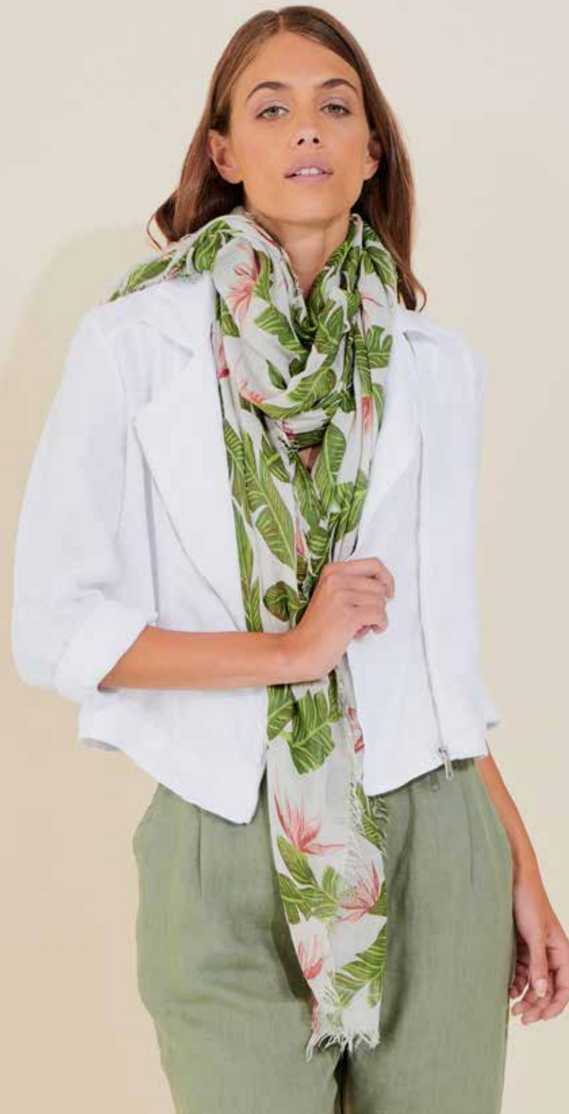
9733 zip jacket