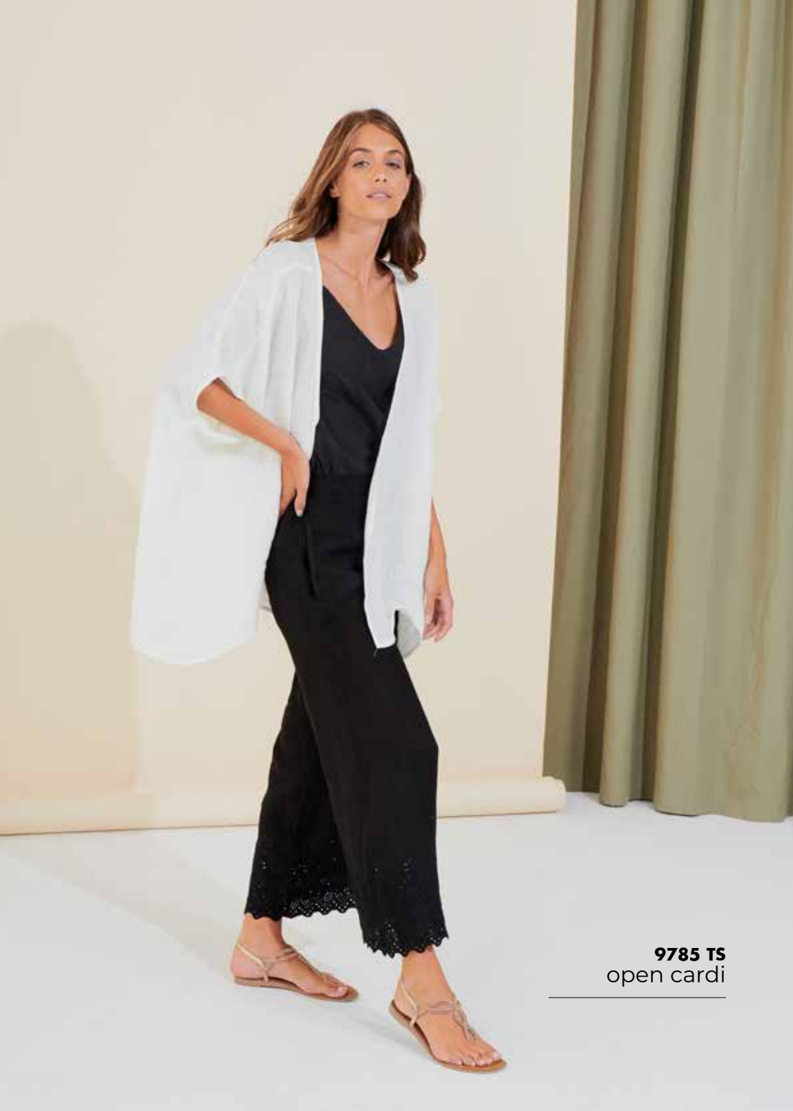
9785 TS open card