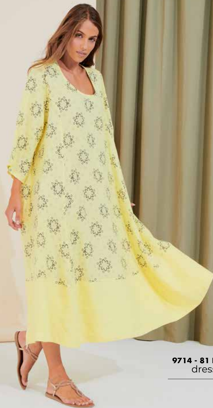
9714 - 81 B dress