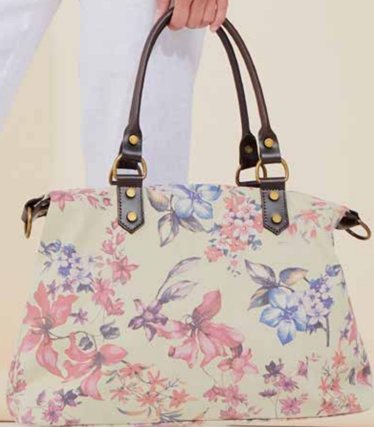
SOFIA canvas bag