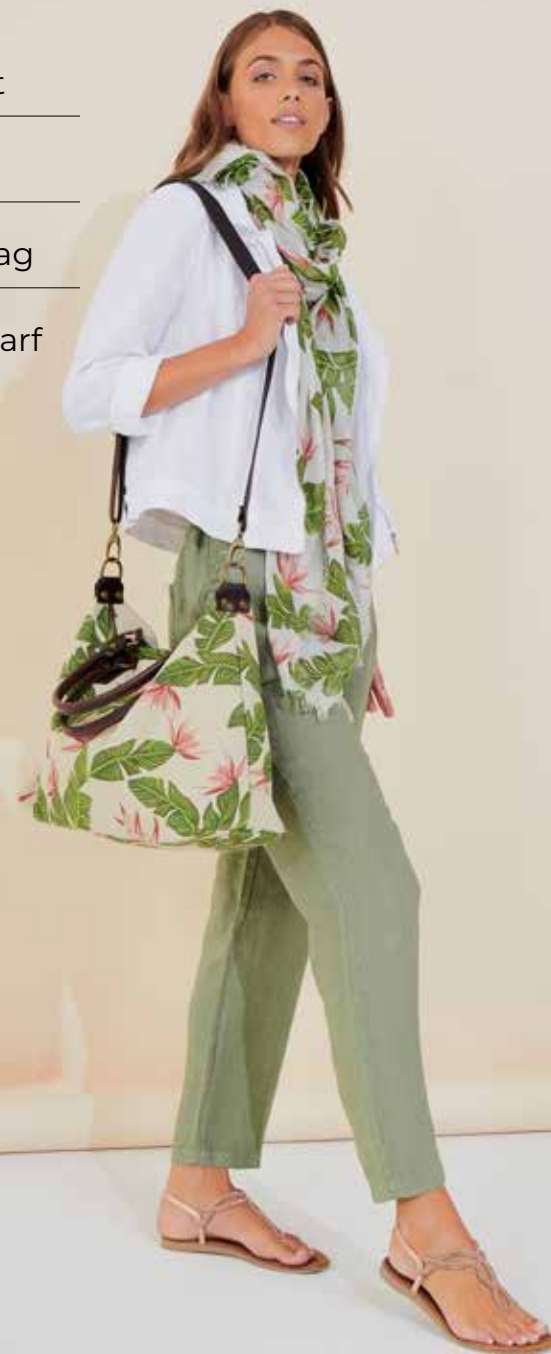
81414 - 71 modal scarf