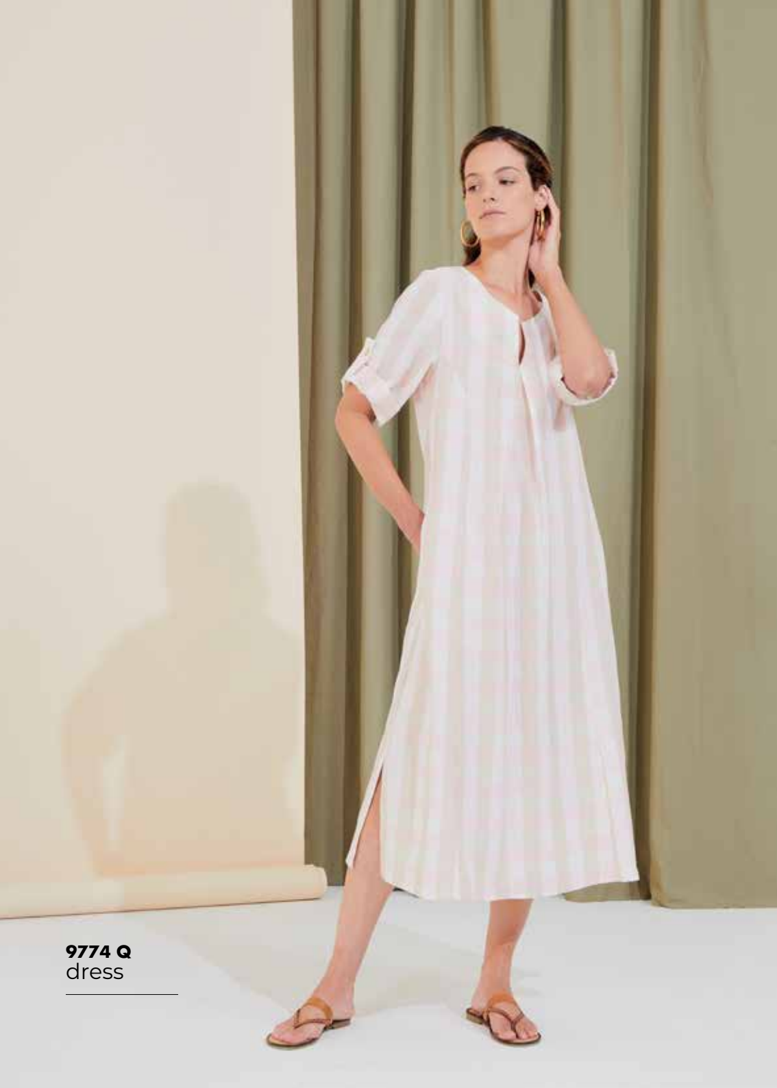
9774 Q dress