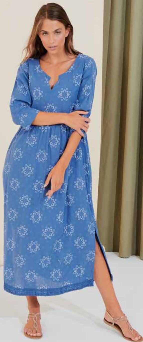
9769 - 81 W cotton voile