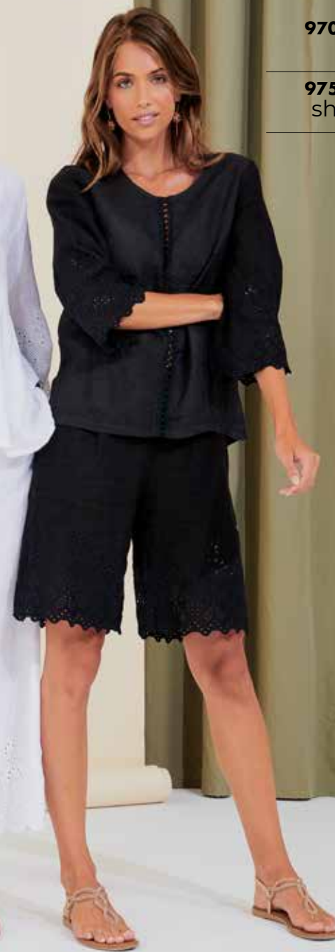
9757 SG shorts