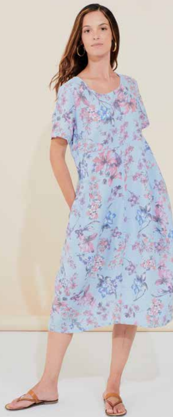
9771 - 36 dress