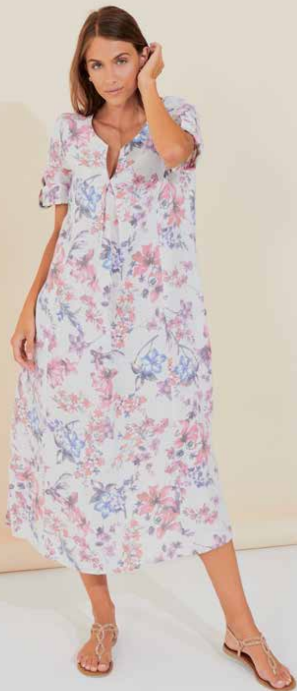
9747 - 36 dress