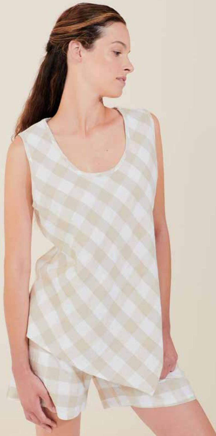
9780 Q shorts