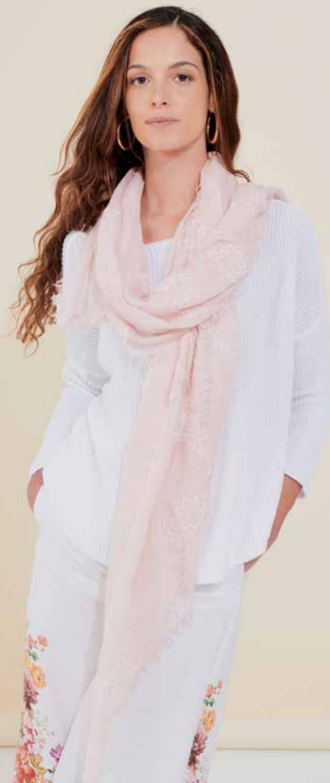
81414 - 81 modal scarf