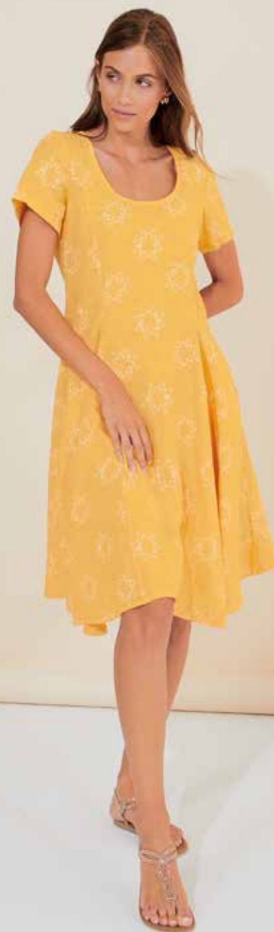
19572 - 81 W dress