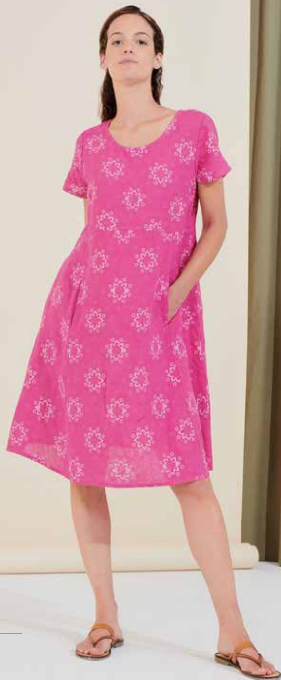
9727 - 81 W dress