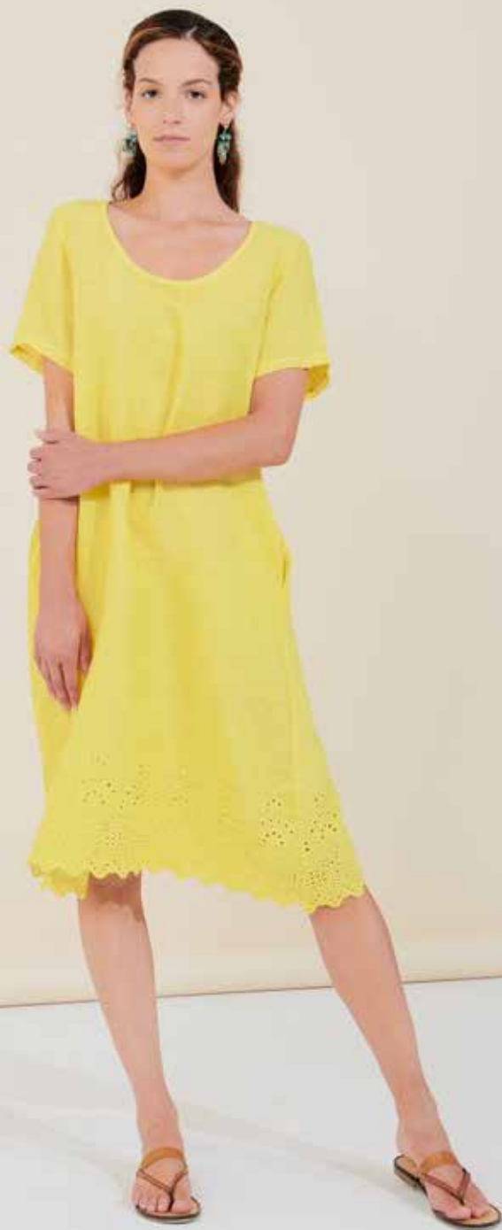
9759 SG dress