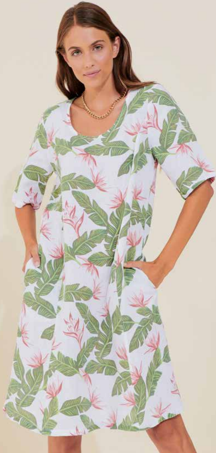
9772 - 71 dress