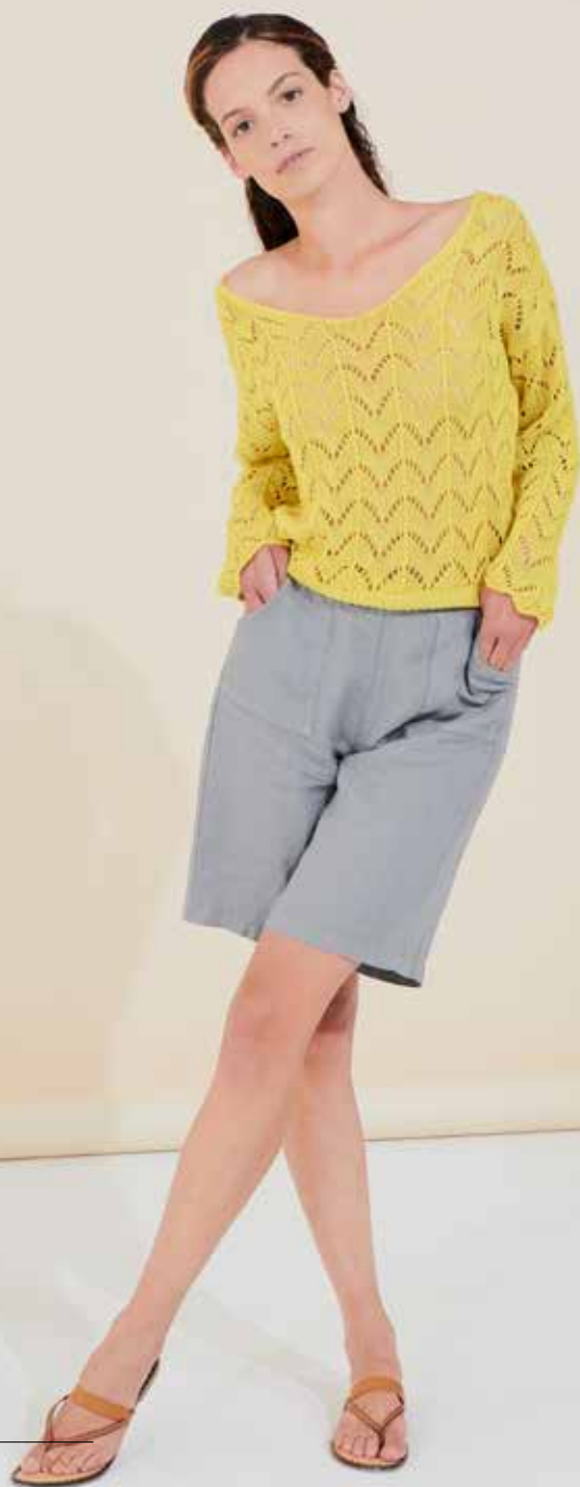
BB 022 knit top 100% cotton