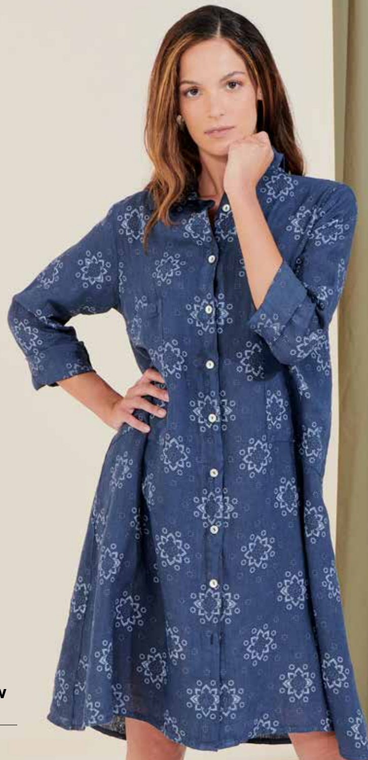
9705 81 W dress