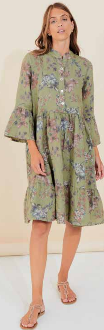
9764 - 36 dress