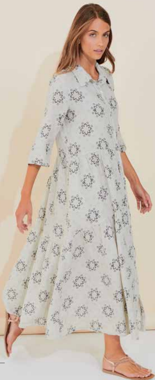
9761 - 81 B dress