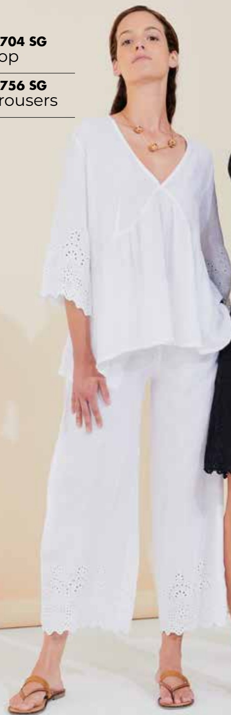
9756 SG trousers