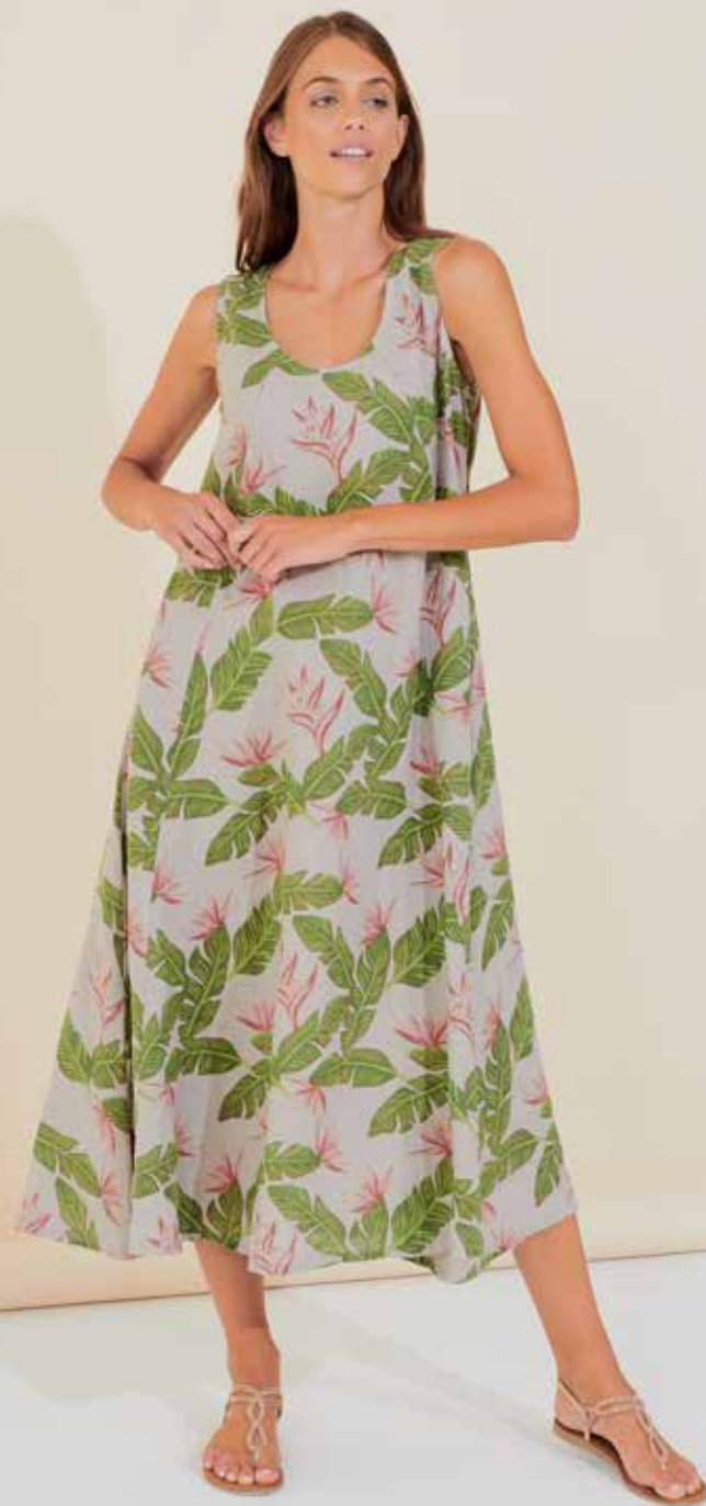
9768 71 dress