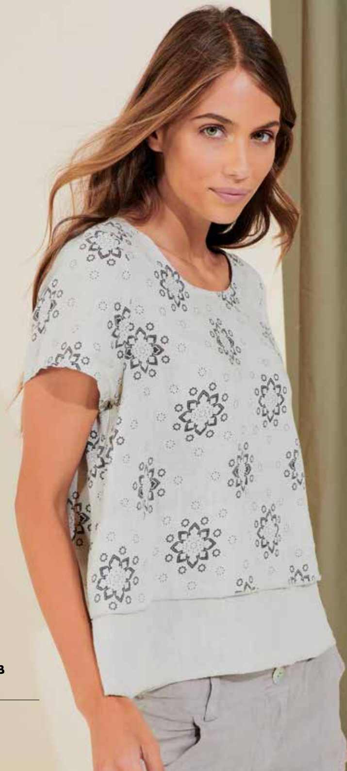
9035 - 81 B shirt