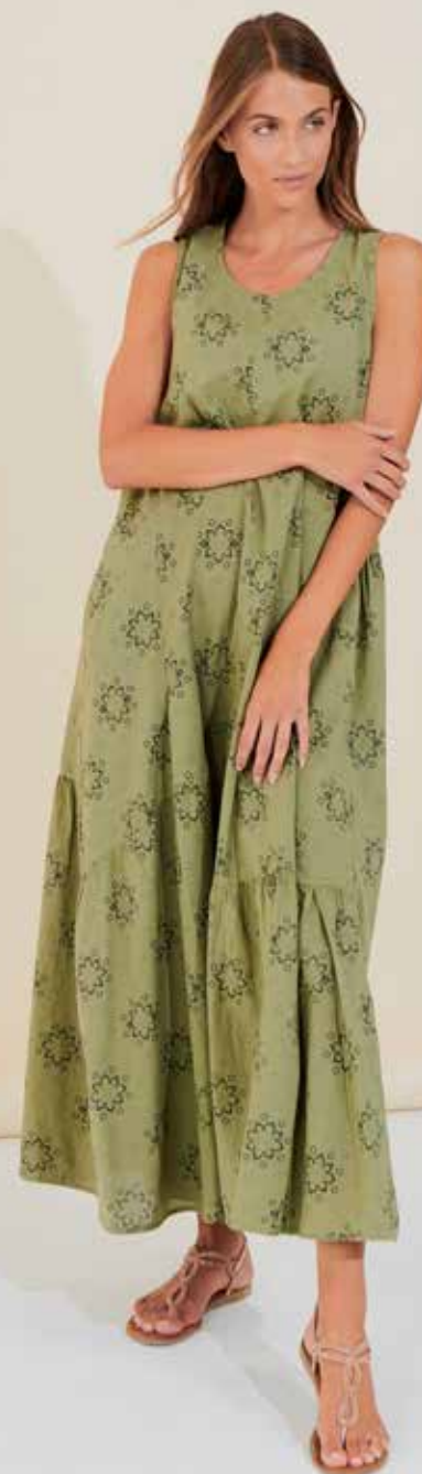
9762 - 81 B dress