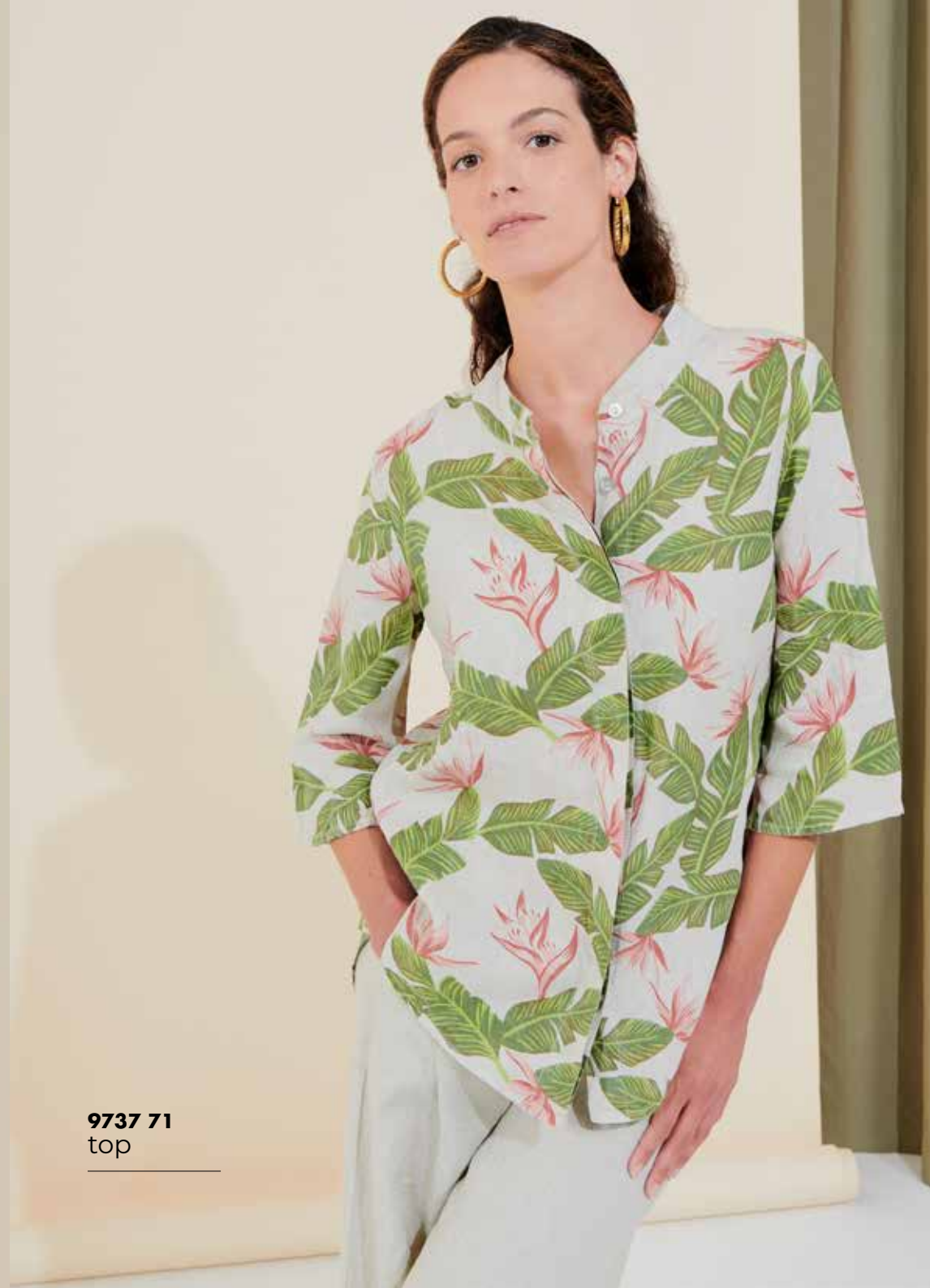
9737 71 top