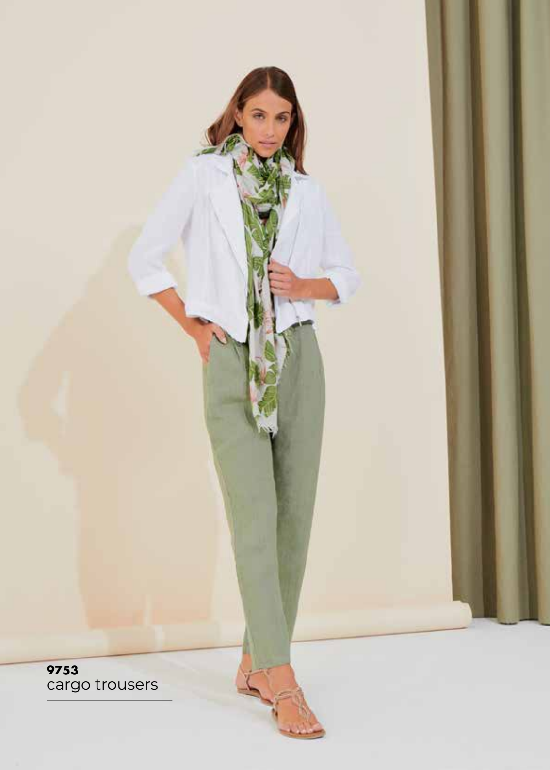
9753 cargo trousers