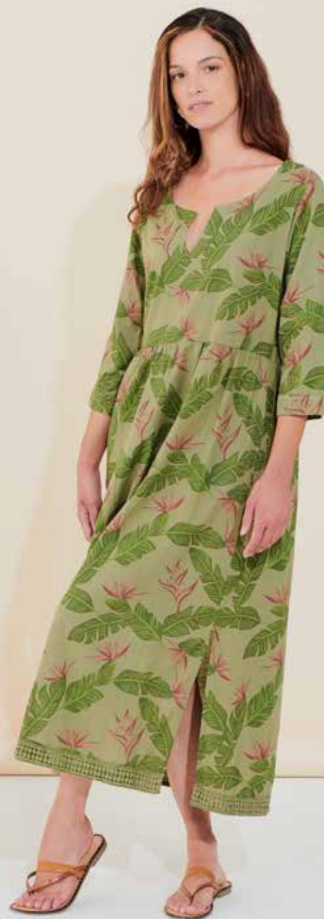
9769 - 71 cotton voile